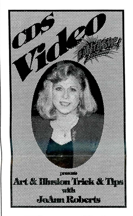
VHS, approx. 60 min. Coming soon — PAL format