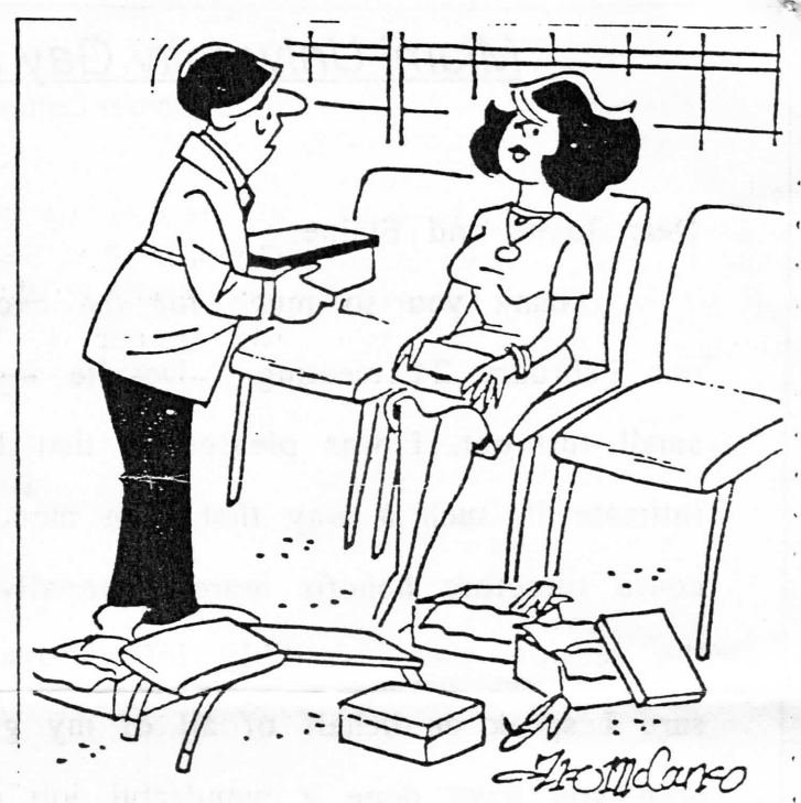
"Here's one you may like . . . size 10 on the inside and size 5 on the outside." sire."