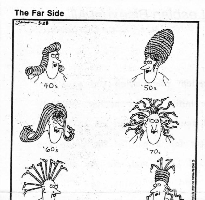
The evolution of Medusa's hair