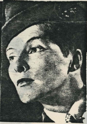
KATHARINE HEPBURN in disguise for "Sylvia Scarlett" in 1935.