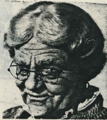
JAMES CAGNEY impersonated a female in the 1957 film "Man of a Thousand Faces."