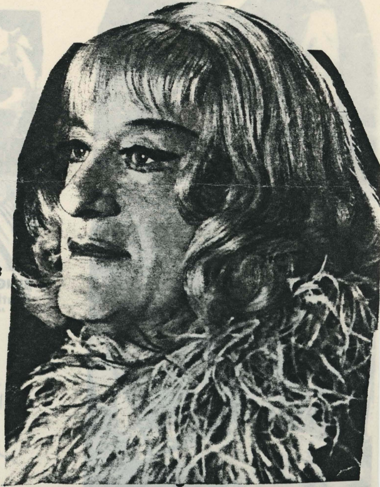
GEORGE SANDERS portrayed a female impersonator in the film "The Kremlin Letter" in 1970.