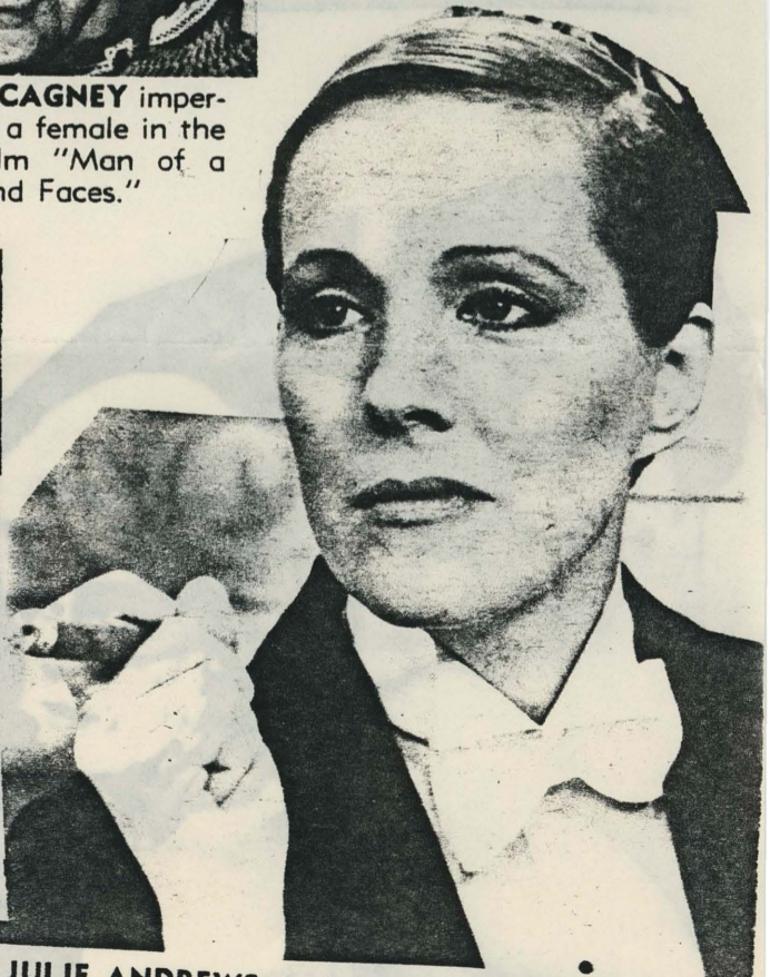
JULIE ANDREWS , in last year's "Victor/Victoria," played a female singer who, unable to find work, resorted to portraying a man and ended up landing a job as a female impersonator.