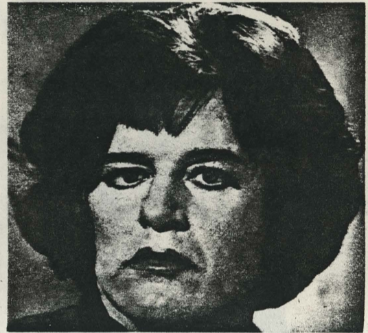
ROD STEIGER dressed in drag for "No Way to Treat a Lady" in 1968.