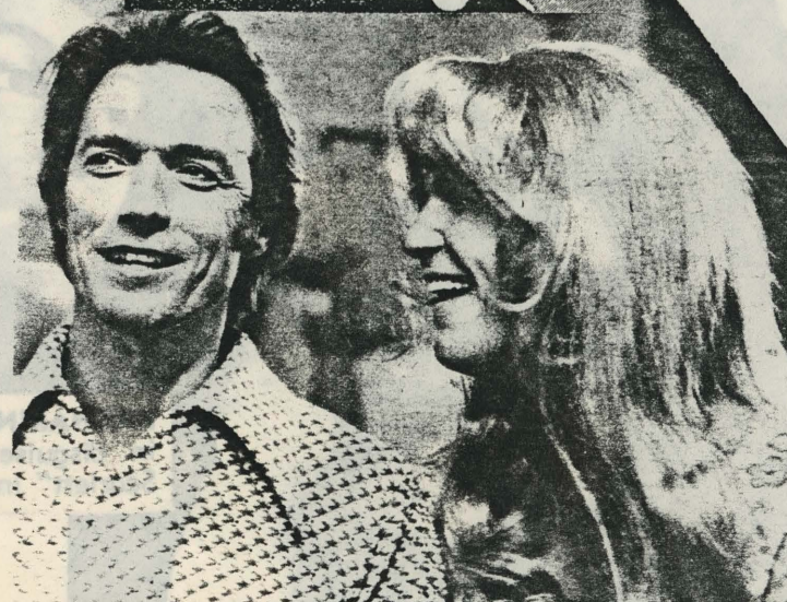
JEFF BRIDGES went in drag when he and Clint Eastwood starred in "Thunderbolt and Lightfoot" in 1974.