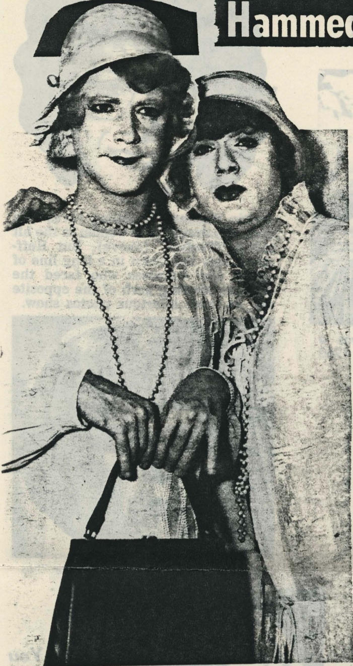
JACK LEMMON and TONY CURTIS (right) dressed as dames in 1959 for the rib-tickling movie "Some Like It Hot," about an all-female band.