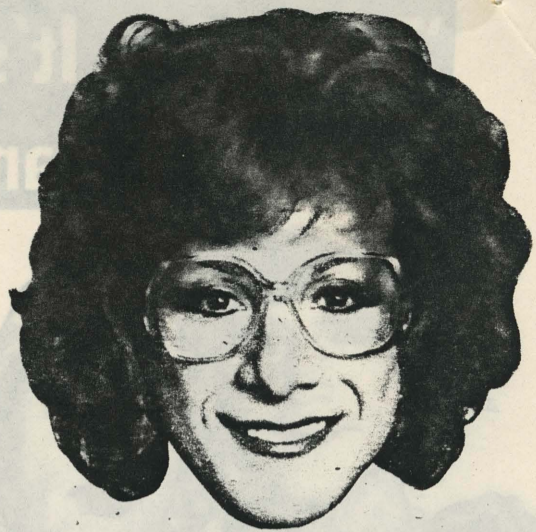
Dustin Hoffman is getting raves as a man who dresses as a woman in the hit movie "Tootsie" (above). But Hoffman's only the latest in a long line of actors and actresses who faced the cameras wearing garb of the opposite sex, as these hilarious photos show.