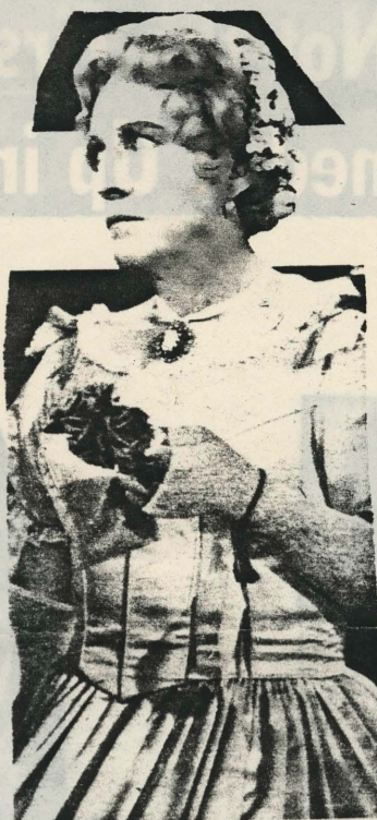
BING CROSBY was a Southern belle in 1960 for "High Time."