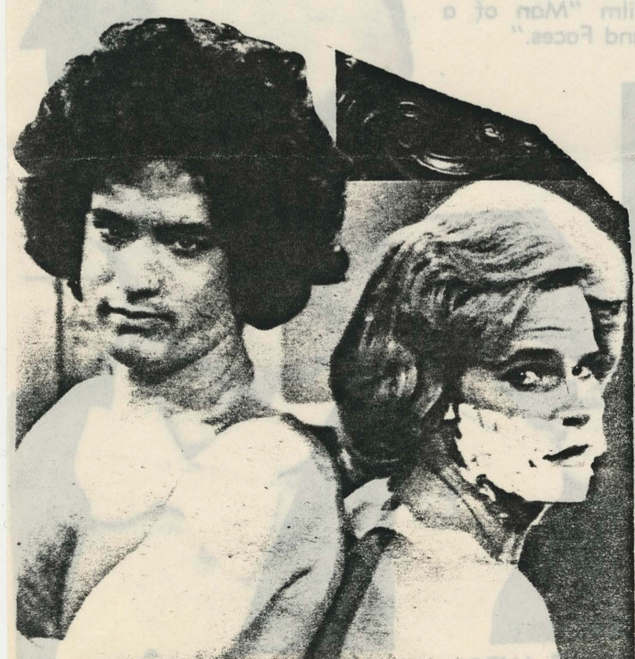
TOM HANKS and PETER SCOLARI , in the 1980 TV series "Bosom Buddies," pretended they were women so they could live in a low-rent all-female hotel.

Hidden behind a per cap, blonde wig and old-style glasses — the role of a German cloakroom attendant — is one of screen's most virile European stars. The swashbuckling hero of action films, Curt Jurgens couldn't resist the offer to play the lead role in a Munich television play.