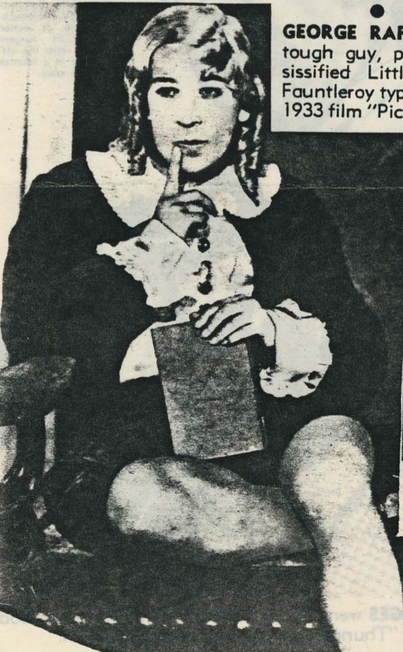
GEORGE RAFT , film tough guy, played a sissified Little Lord Fauntleroy type in the 1933 film "Pick Up."