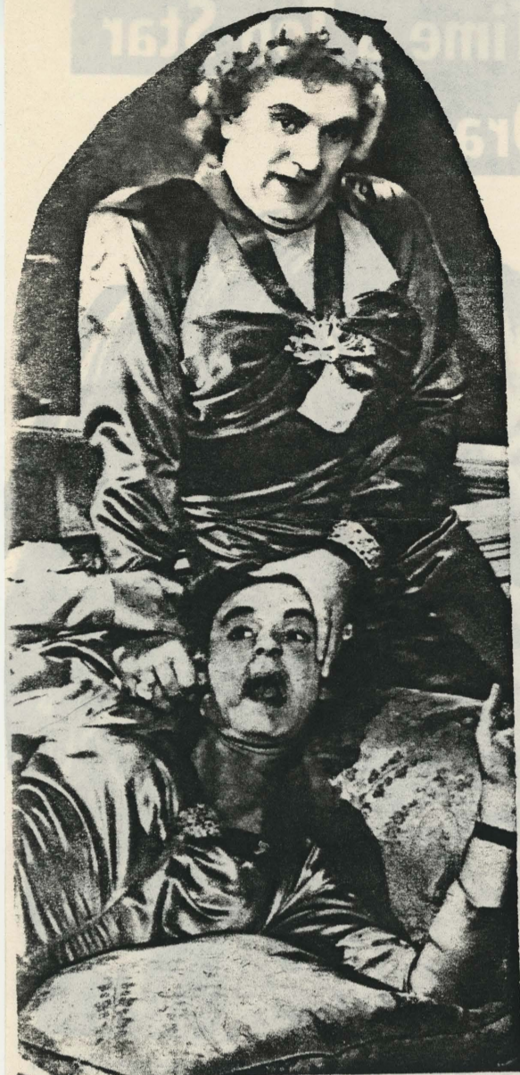
DENNIS O'KEEFE and WILLIAM BENDIX (standing) got all dolled up for the 1944 movie "Abroad With Two Yanks."