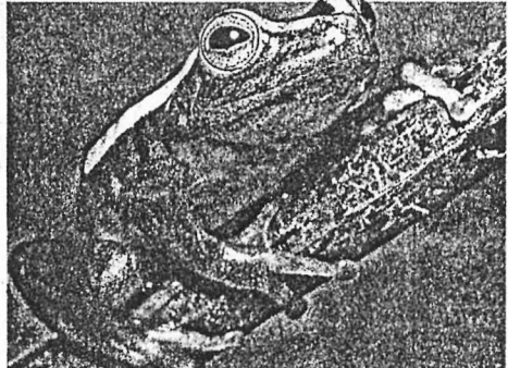
AFRICAN REED FROGS baffle scientists.

already begun to develop male sex organs. frogs in his laboratory turn into males. male's eggs. They never switch back to female.