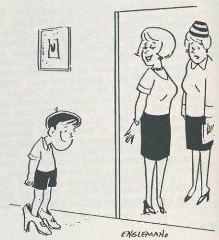
"Isn't that cute? He's already trying to fill his father's shoes."

I have arrived at these feelings about myself by getting out to meet and talk with others, comparing notes on how it began and progressed to where we are now, what we would like to do in the future, and how to get there. It is necessary to decide for one's self where we fit in the wide spectrum of cross-dressers; by this I mean the range from fetish-underwear, through full-drag and full-time to transexual. One should definitely not hurry in this process of selfevaluation; go step-by-step, as far as you need to. And along the way, we can accept our nature and have some fun, without worrying about the whys or wherefores. So, come to our club meetings, and let's party!