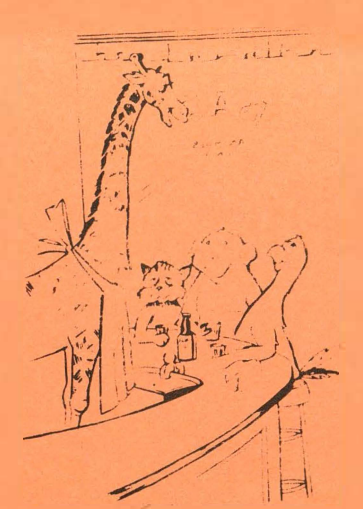
"The highballs are on me!