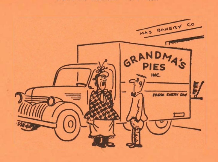
"It may be a good idea, but personally I don't like it."

"You will meet ... indeed, have already met ... a short transvestite