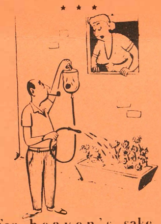
"For heaven's sake, George, why don't you go out and buy yourself a watering can?"