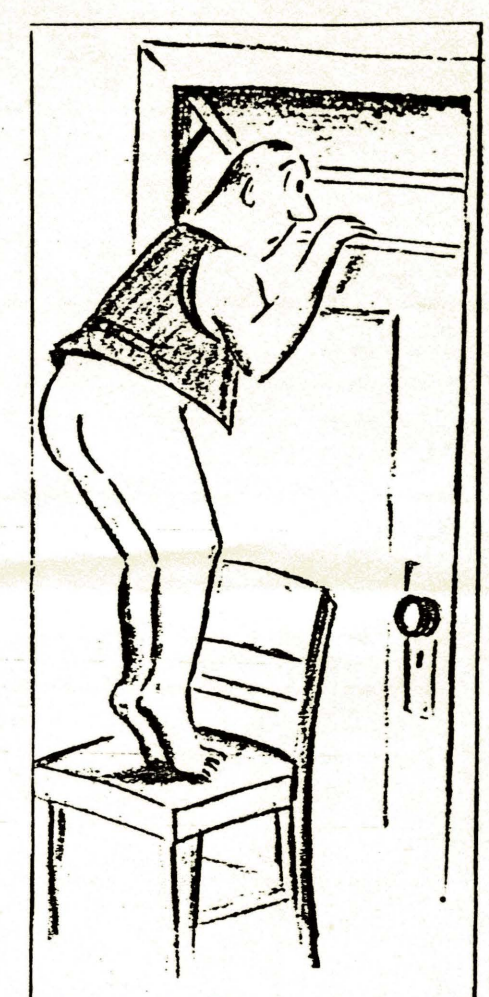
TRANSVESTISM: A morbid desire to peer over transoms while wearing only a vest.

P. O. Box 4887 Poughkeepsie, N. Y. 12602