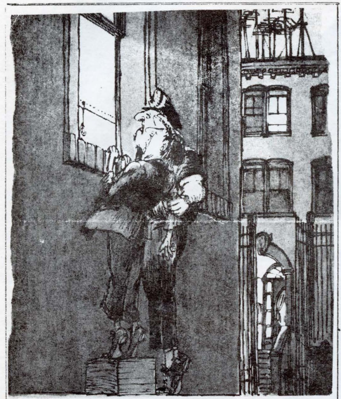
"You, there, no, no, HIM -- the guy with the pink housecoat and the net stockings, yeah you -- do you want to press charges against this Peeping Tom?"