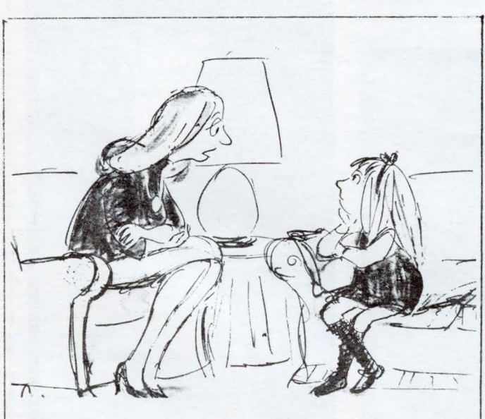
"Darling, if you want Mommy to keep dressing you up as a girl, you're going to have to stop putting frogs in my purse."