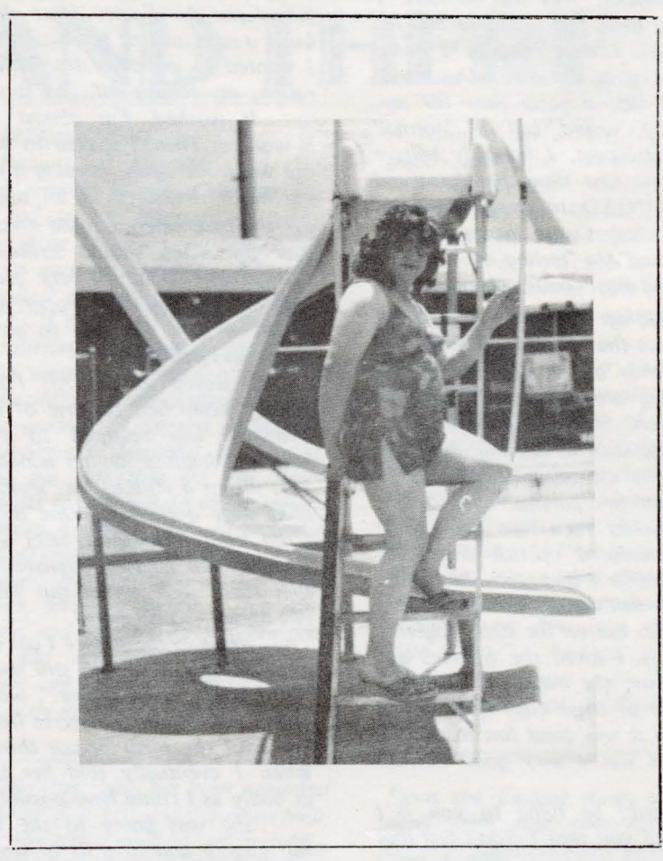
IANICE IN A PLAYFUL MOOD