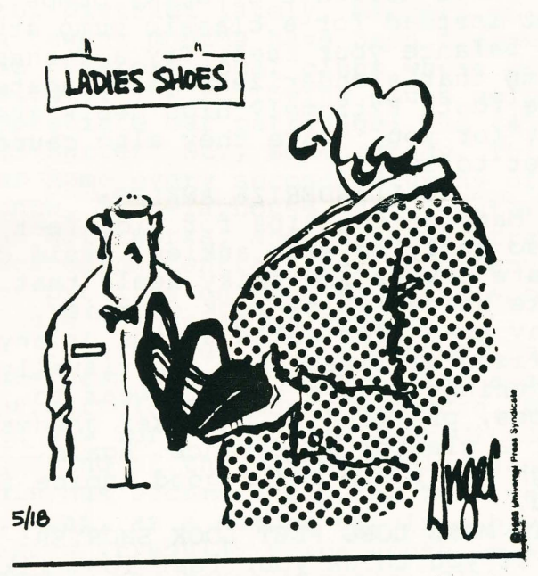
"I definitely don't have your size in beige."

Thanks for bringing us up to date Diantha. It was good to hear from you. Best wishes for a most happy rest of your life.