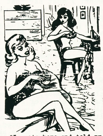
"I wrote home and told my parents that I married a local TV personality, but now that they are coming here we'll have to explain what the TV stands for."