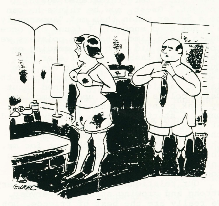
"You haven't lost any weight, my dear. That's my bra and panties you're wearing."