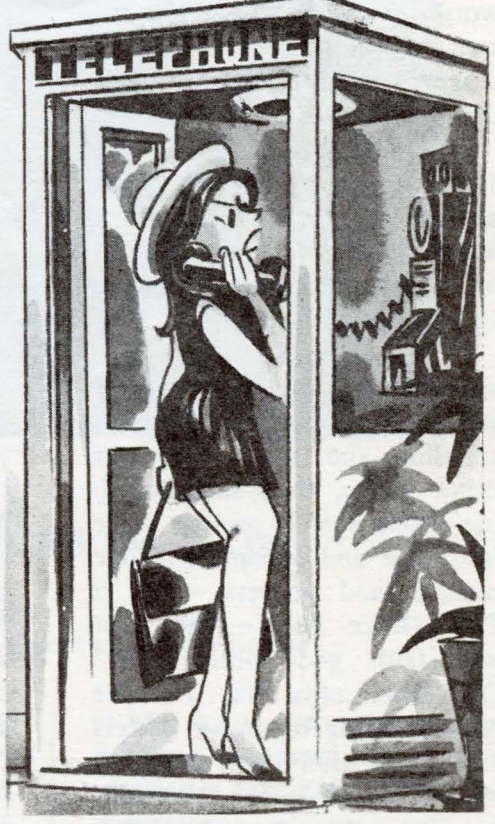
"Mother, don't worry. I'll be a good boy!"