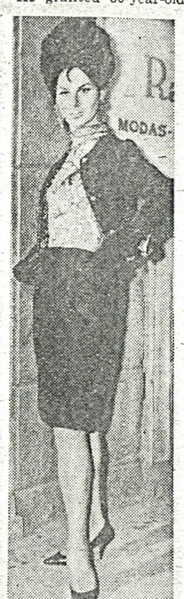
-accepted as a woman, April became a fashion model.