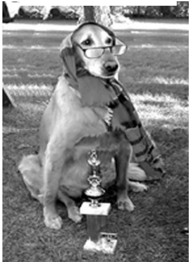
The official picnic security dog Protecting the trophy.