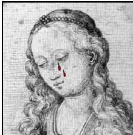
Statue of the Virgin has been shedding bloody tears with XY (male-typical) cells.

The emerging intersex community, like the transgender community, is composed of a diverse group of people who have