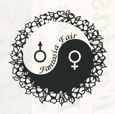
Sponsored by the Outreach Institute for Gender Studies

OIGS has produced a series of videos that include some of its more significant seminars, workshops, and colloquia at $39.95 ea. (plus $4.95 each for shipping. & handling). Topics include: SRS Procedures & Protocols; Relationship Issues for Wives and Partners; and Pathway to Gender Happiness. OIGS, 126 Western Ave, Suite #246, Augusta, ME 04330.