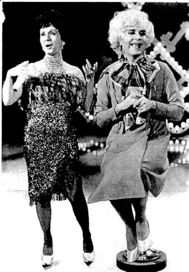
3/22/72: Debbie Reynolds performs with Rich Little in character as Carol Channing, on The Kopykats , ABC.