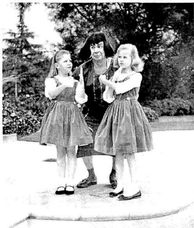
1/14/61: Ken Murray portrays Keely Smith while his two daughters give their impressions of Louis Prima, on The Ed Sullivan Show , CBS.