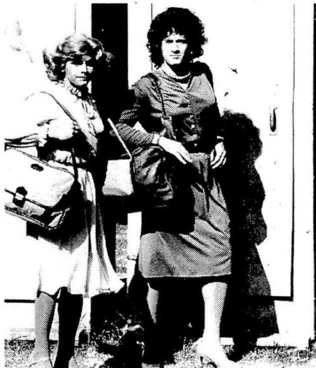
11/27/80: Peter Scolari and Tom Hanks create the alter-egos of Hildegard and Buffy to move into an all-girl hotel on the premiere episode of Bosom Buddies , ABC.