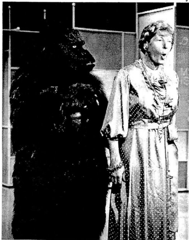
1/1/64: George Barrows in a gorilla suit sneaks up on a crossdressed Danny Kaye, on The Danny Kaye Show , CBS.