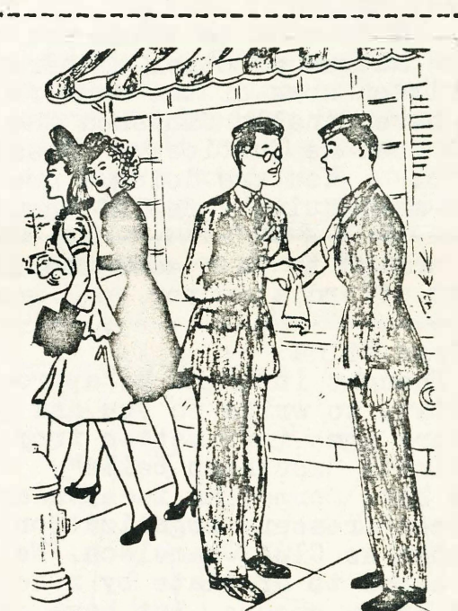
"No, Horace-They're just a couple of nasty boys dressed as girls! Don't bother with them, Darling!"

Dont forget that this is your paper. SO send in anything that you think other members would like to read or see. HOW ABOUT. ITTTT