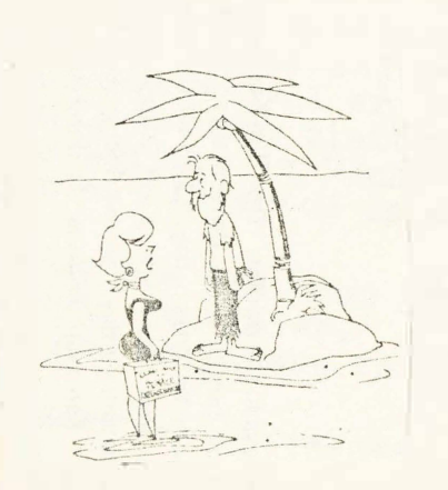
"I'm afroid you're in for gaile a shock."