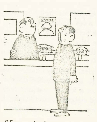
"Someone's just snatched my handbag."