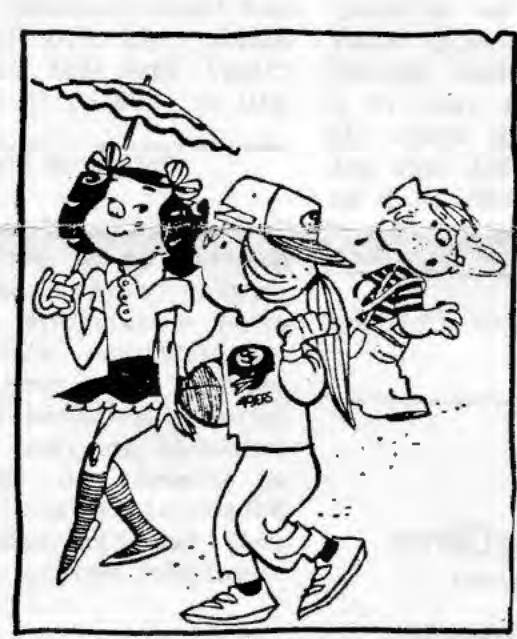
"I'LL BET WE SHOOK HUM UP THAT TIME, TOMAY!