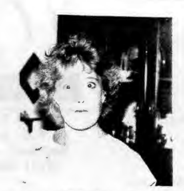
These ARE Boys, Diane!