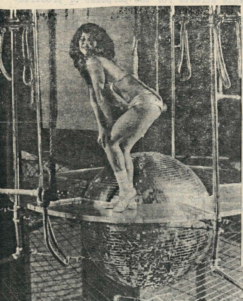
DiscoBat: so what else's new?