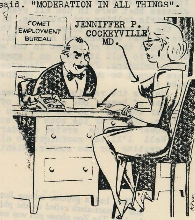
"I want a job as a 'go-go' girl!"