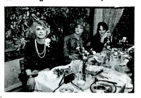
It's late at night and the girls are going assertive during a house discussion.