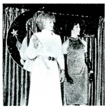
Our beauties line up for the Finale! Can you spot our Geri?