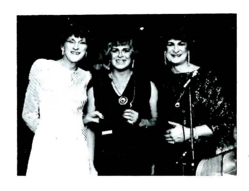
MORE MEMORIES DURING THE FAIR