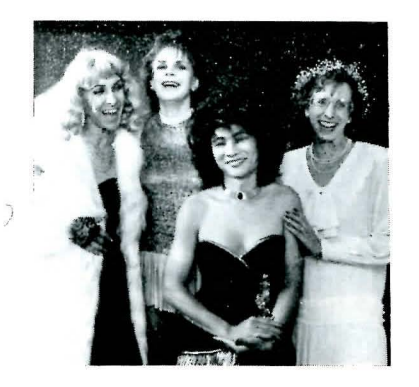
A video replay after the Ball