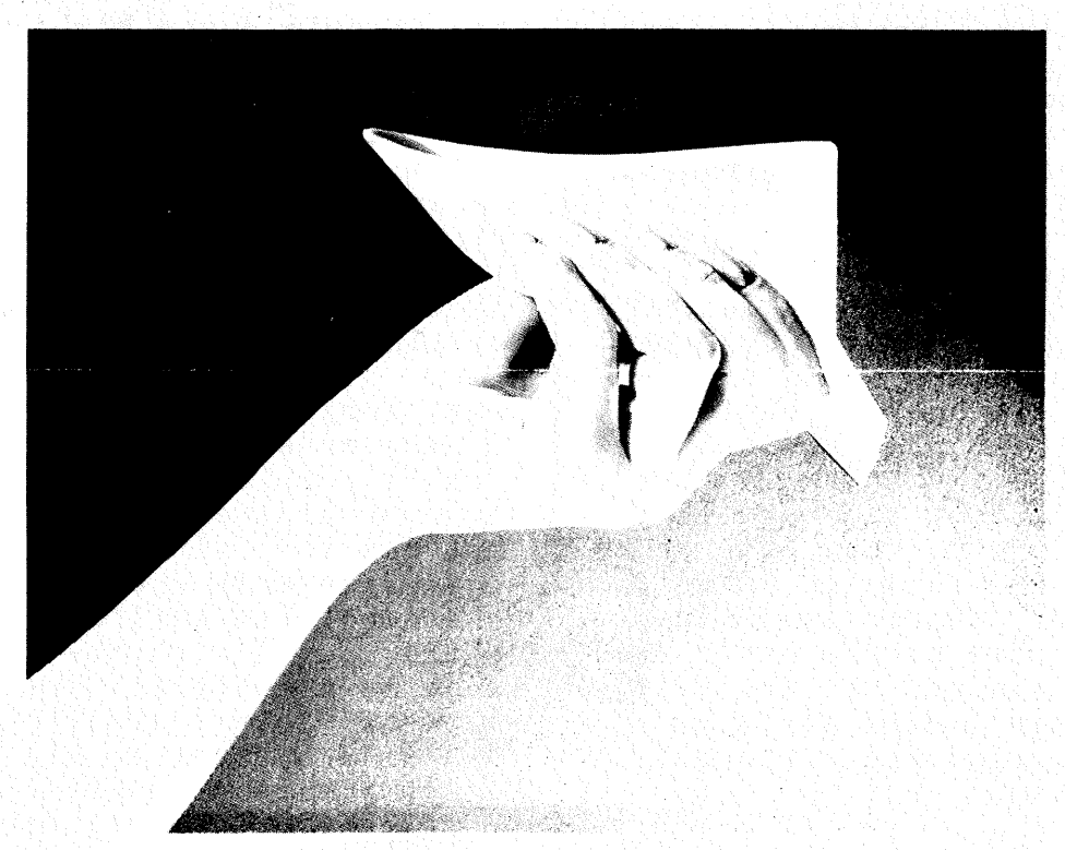
Pat'd: U.S.A., Canada, West Germany, Gt. Britain, Netherlands, Switzerland