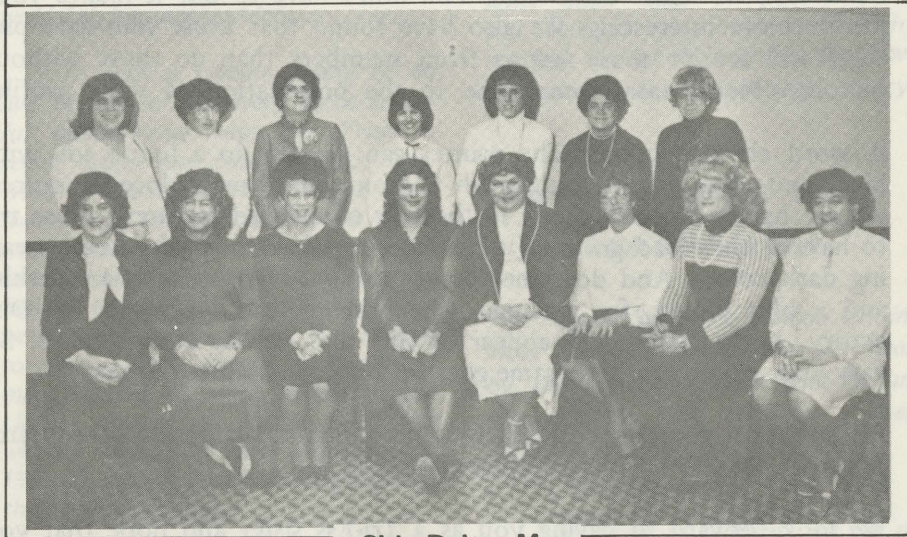
Chi - Delta - Mu

WHAT IS IT? WHOM IS IT FOR? WHAT ARE ITS GOALS?