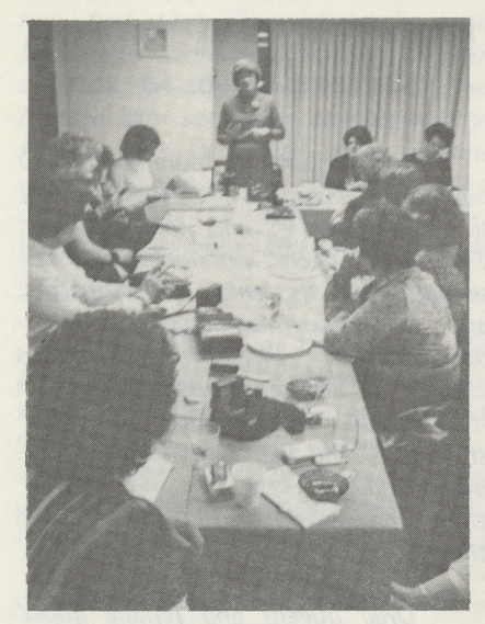
The Girls Of Chi - Delta - Mu

Many people are indeed surprised to find that Tv's aren't looking for sex like the drag queens, or for a living, like the drag prostitutes and female impersonators. Many gay people are surprised that heterosexual Tv's exist at all! In fact, to the vicarious thrill seeker, real Tvism probably appears shockingly boring.