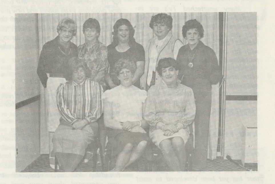
Chi - Delta - Mu

Few transvestites are fortunate enough to have a wife who "understands" and cooperates with her Tv husband. These wives are called "A" wives and often help their husbands choose proper clothing. They also often accompany their Tv husbands on trips involving shopping and dinner. Unfortunately for the vast majority of Tv's, most wives fall in the category of "C", "D", and "E" wives. This often means that the husband has to hide or repress his dressing activities.