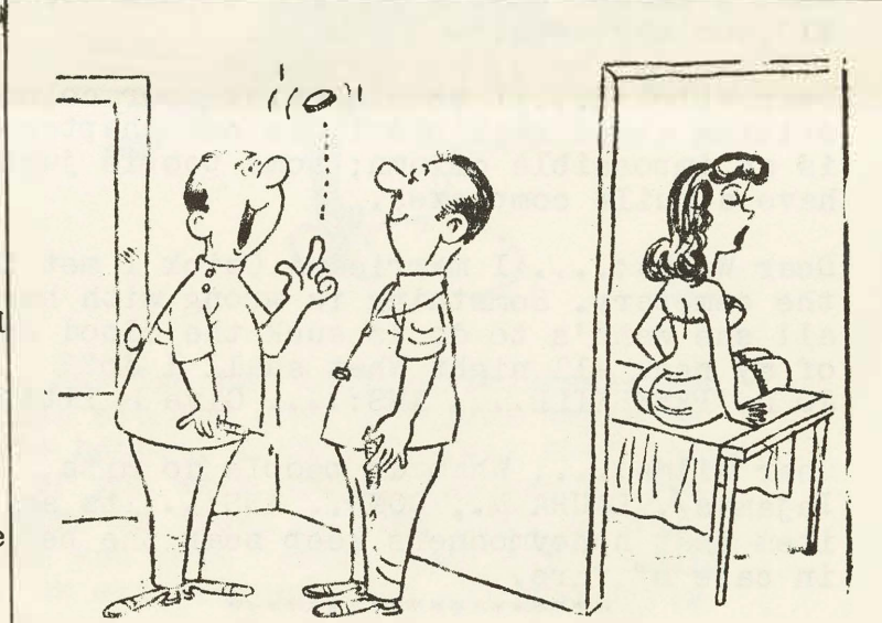
Heads she's a he: tails he's a she.

****** Don't worry about your station in life - there's always someone who will tell you where to get off. **********