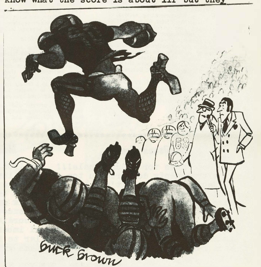
"Other than that, he's your complete football player."

********** If you have news fit for print send it in.