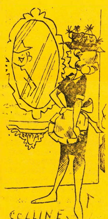
"And my wife thinks I'm not creative."

dialog between you and your husband in order to plan your future — and his.