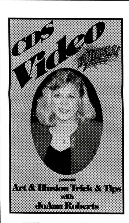
VHS, approx. 60 min. Coming soon — PAL format