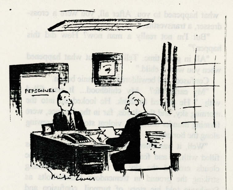
"There's no smoking anywhere in the building, but on Fridays you can come to work in drag."