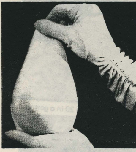
SATISFACTION GUARANTEED *