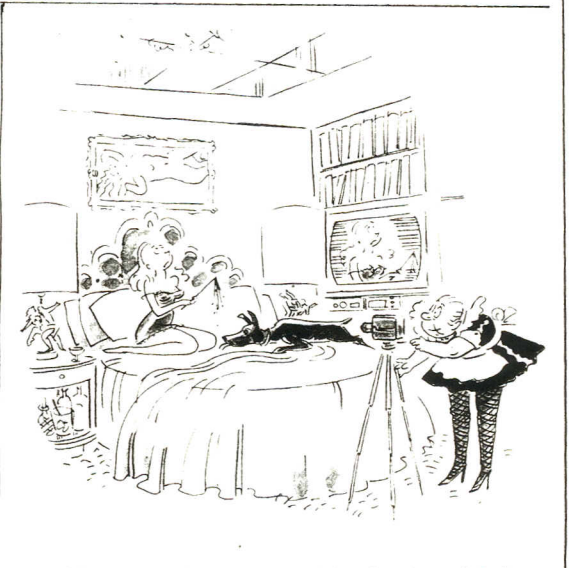
"Isn't this just a little too kinky, Harcourt?"