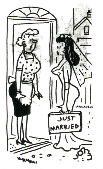
"So he wants to wear your nightie to bed! That's not the end of world, you know!"

We can only trust that each of us will grow a little more tolerant and understanding of the unique needs of all others, be they man, woman, or both.