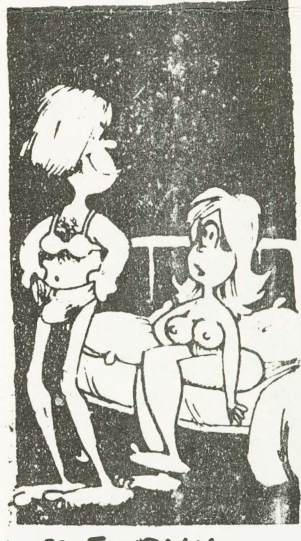
IN FINGLLY GETJING IN TO YOUR PANTS!