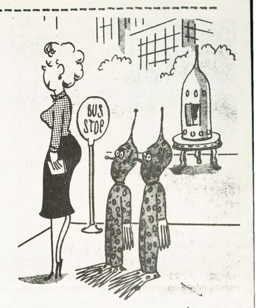
"Earth man not built bad. He just wears ridiculous looking clothes."