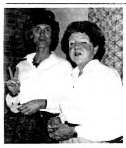
The Photo Page