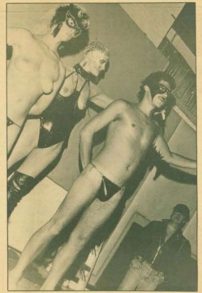
Men and women participated in Leather Weekend at Atlantis

Sunday's erotic auction, emcee'd by Mistress Kathy, resplendent in hot pink leather, successfully raised funds for several charities. These included the AIDS Food Bank, the Sebastopol