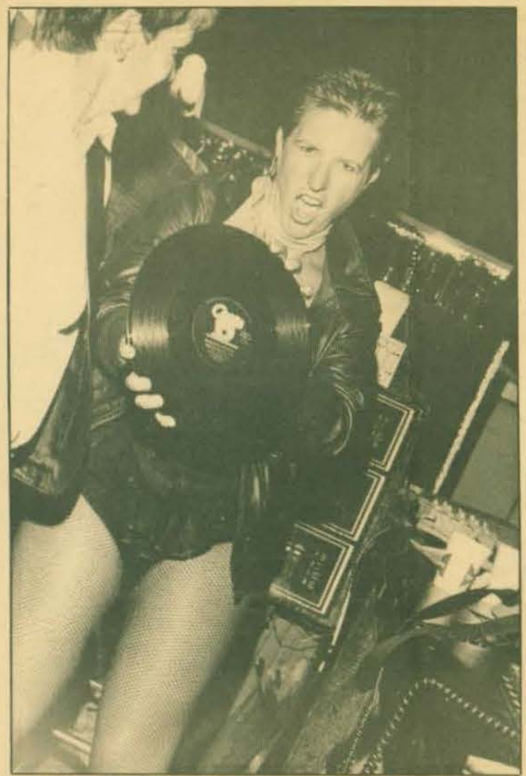
The DJ got into the spirit of Leather Weekend at Atlantis