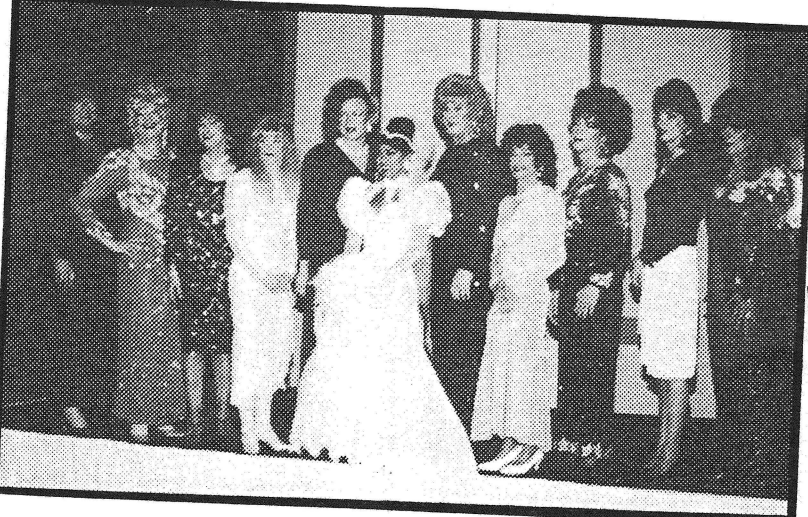
Friday Night Fashion Models.