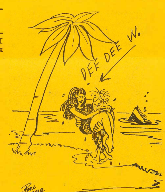
'Nobody's ever risked their life for me before Most men don't think too highly of female impersonators."