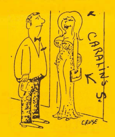
"Thanks for a lovely evening, pal. I gotta go get out of my wife's clothes before she gets home."