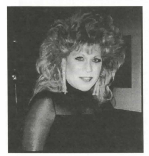
"There is no truth. There are no facts; just data to be manipulated."