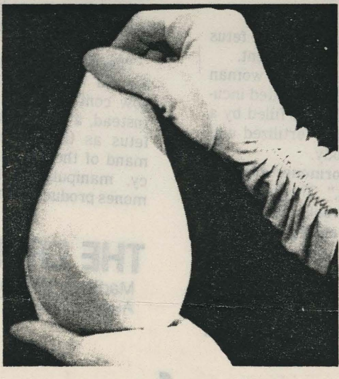
SATISFACTION GUARANTEED OR YOUR MONEY REFUNDED.