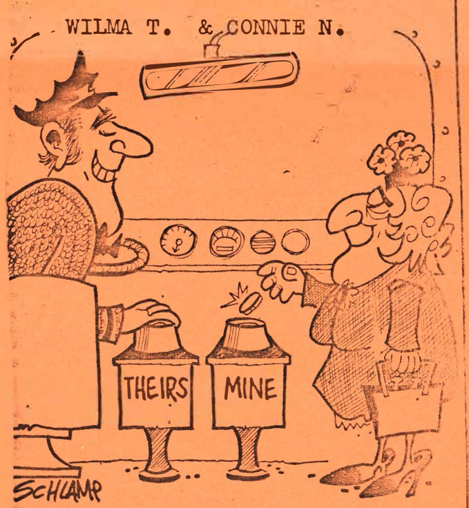
THE REPORT OF street & main Dies 161.31

I think I'll send my wife away, Her milk man comes three times a day. New Book: The Perils of Drop-Seat Underwear, by Seymour Stern.