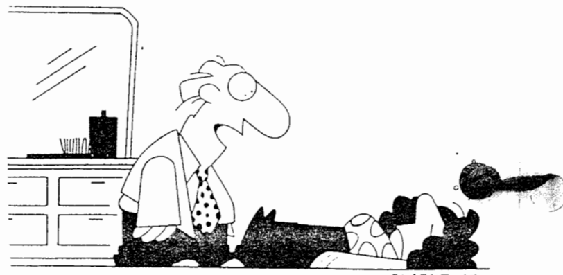
Honey I didn't say I'm a transvestite—I said my left vest is too tight!