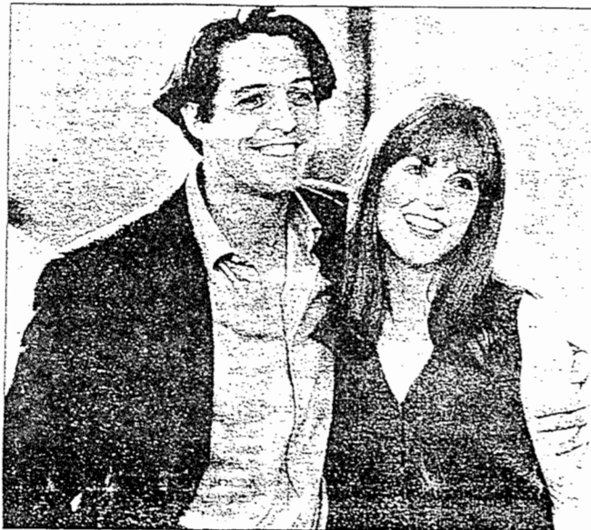
"NINE MONTHS": Hugh Grant is Samuel and Julianne Moore is Rebecca.

WHAT HAPPENED WAS... (to be released March 26) • JUST LIKE A WOMAN 1992, R, 102 minutes, Evergreen Entertainment (in release) • NINE MONTHS 1995, PG-13, 99 minutes, 20th Century Fox Home Entertainment (in release)