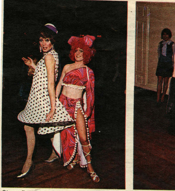
I won the best Easter bonnet prize" the last ball I came as Bridget the Midget" the sex-change operation: "It's terrific!"