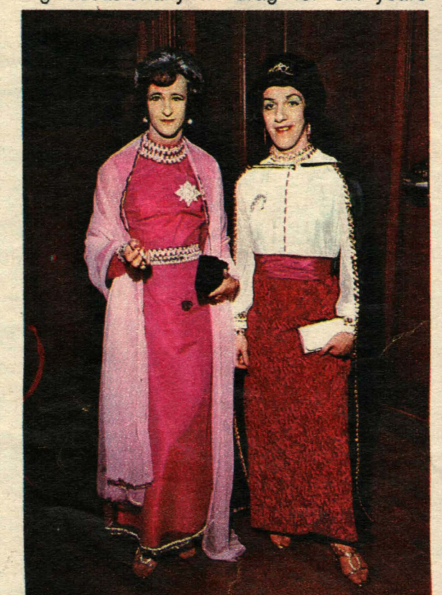
Bristol, who has been dressing in drag has been 40 years in drag ("My wife