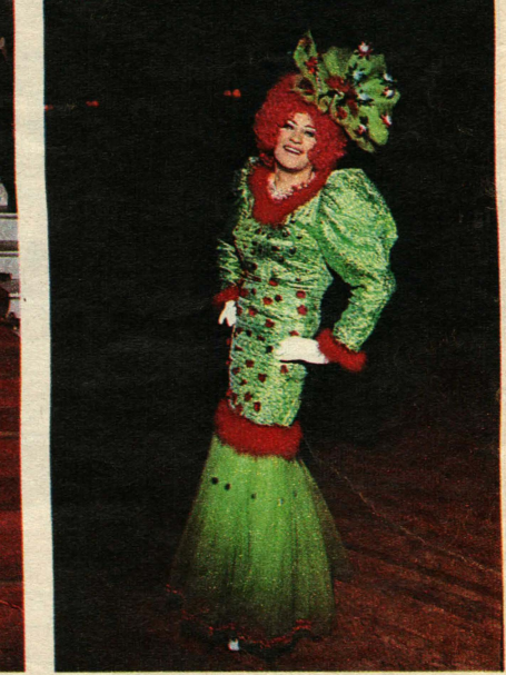
salesman from Chiswick who toured army kicked out of Wales 'cos I couldn't sing. only when I'm abroad on vacation," he year. A former conjurer, he designs all