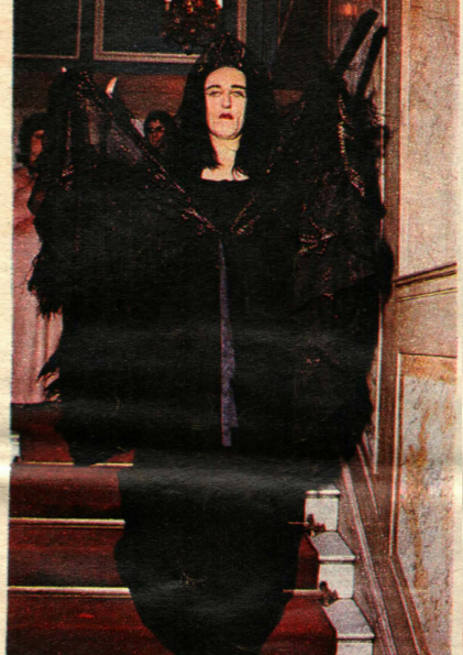
'The Bride of Dracula' is an antique dealer in London who first put on drag at a Notting Hill pageant this year. "I'm over 50 - too late for a career," he said