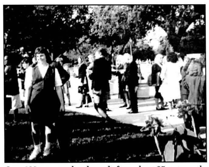
Over 100 transgendered people from about 35 states gathered for the kick-off Press Conference.