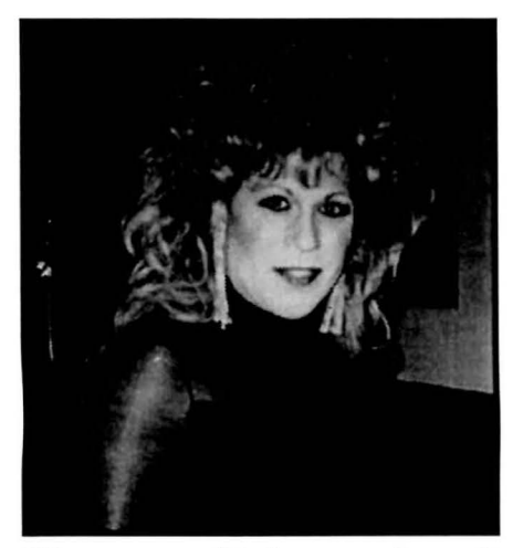
"No one can whistle a symphony. It takes an orchestra to play it."