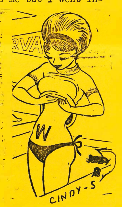
"That old college try isn't bad!"

I saw the beautiful Taj Mahal in India . . . the greatest erection a man has ever had for a woman since the beginning of time.