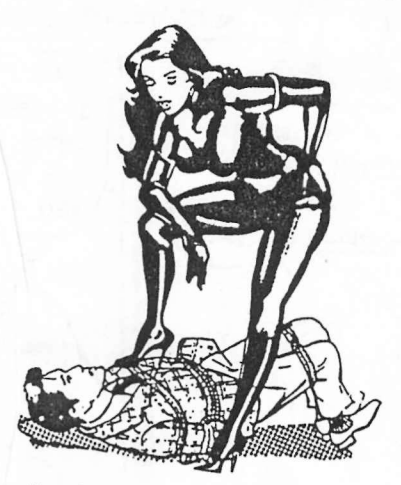
'So, how come you didn't renew your