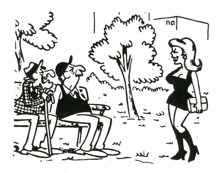
"Elmer just is'nt one of the boys any more since he got involved with that 'PHOENIX' place!"