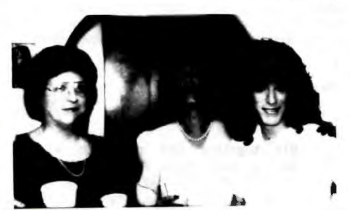
The Photo Page