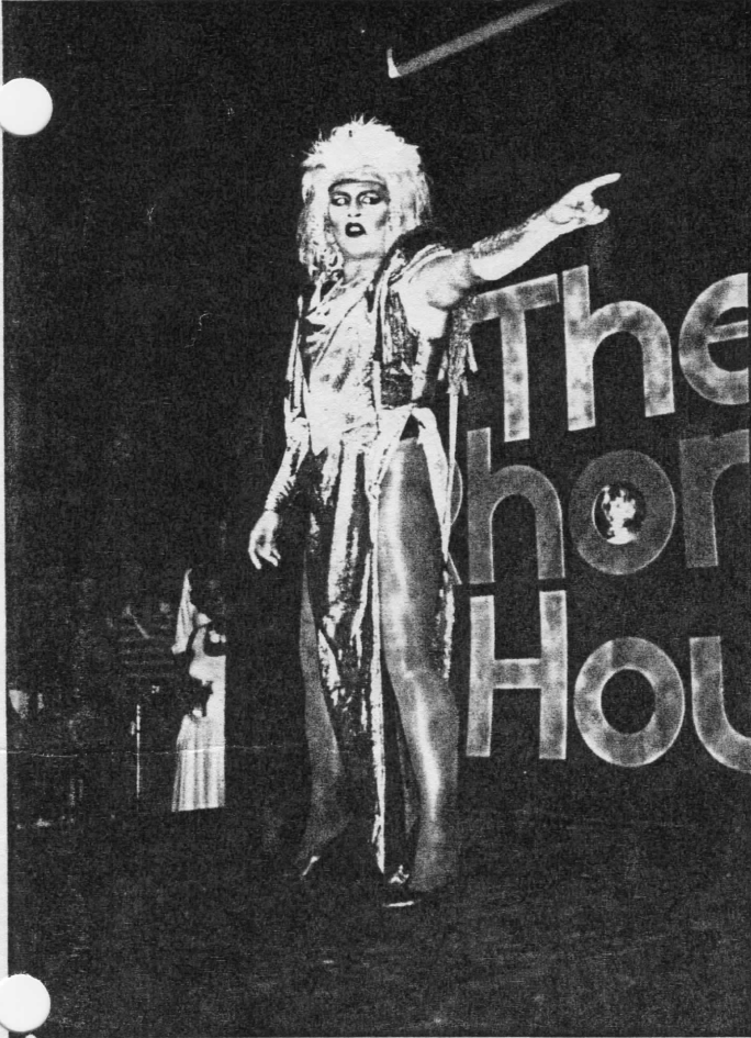
Hurricane Summers on Stage