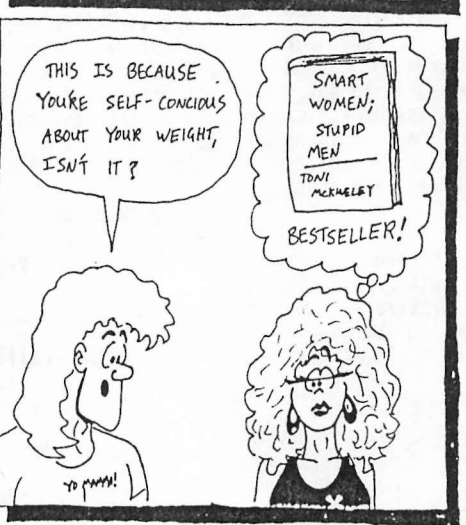
ANGEL-PO BOX 302-Peacedale, Rhode Island 02883