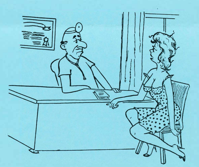
"Meals? I thought you said three MALES a day!"

If more women were open and under standing, I can assire you there would be a whole lot more happy TVs. both married as well as single. Why is it that women frown on men in women's clothes yet they are free to (continue on page 5)