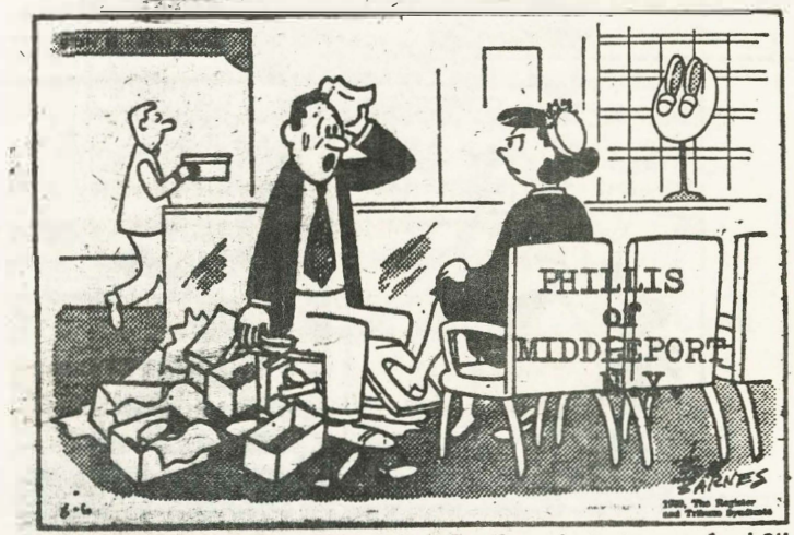
What say we both take a coffse break and start over fresh?

We were happy to meet Monique from Monique ******