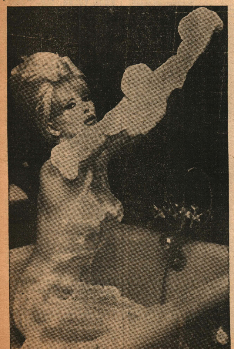
Are these artificially acquired feminine characteristics?

The fascinating case of the "Woman who never was," now making history in the annals of the French Courts, moves inexorably to a climax—with a new bombshell exploding every few days.