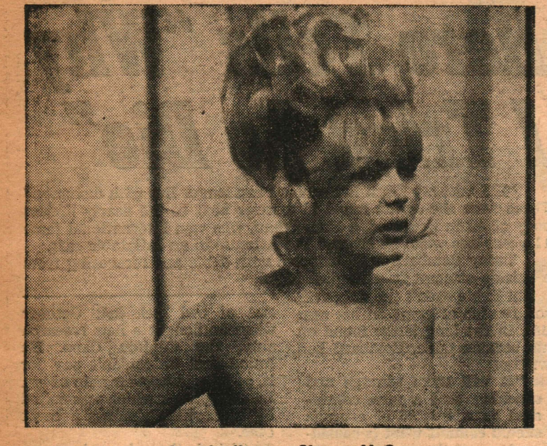
Coccinelle . . . She or He?