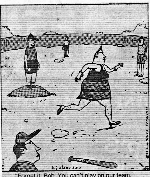
"Forget it, Bob. You can't play on our team. You run like a girl.

(*- most larger stores) Can't find us at a store near you? Send $7.00 for the current issue P.O. BOX 944, WOODLAND HILLS, CA 91365.