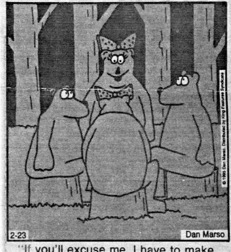
'If you'll excuse me. I have to make a visit to the pines. Wendy, are you going to join me?